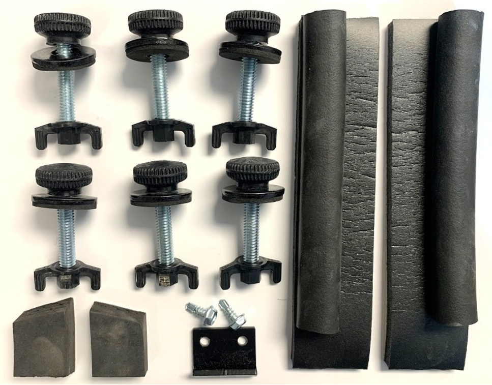
Figure 1 – Picture of Parts