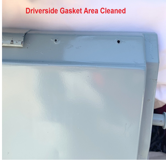
Figure 3 Before Installation Of the Tailgate Gasket

Completely remove all soft-top hardware but do not remove the factory installed windshield gasket. After removing the soft top metal tailgate brackets clean the areas with a wet cloth to remove any dirt(Figure 3). Position the two Foam Adhesive Backed Strips on each side of the tailgate as shown in the picture below(note: these are driver and passenger side specific). Peel off the paper backing and begin by positioning and adhering the end of the gasket that the tailgate will close against first. Then, work your way towards the sides of the vehicle with the gasket. Once the hardtop is lowered into position it should look similar to the picture below(Figure 4).