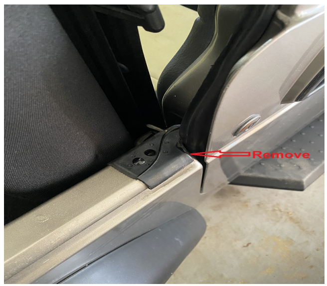
Be Sure To Remove the "Side Panel Corner Seals"

2. Figures 5 below shows the proper location of the installed Top to A-Pillar gasket(Note: these are driver and passenger side specific). This piece located at the top corner where the door closes against the windshield frame fills in a small gap between the hard top and the A-Pillar. Simply peal the paper backing from the gasket and stick it to the end of the plastic doorstop frame. If by chance the gasket will not stick or falls off, a small amount of super glue can be used to assure proper adhesion. Once the hardtop is installed and tightened down, trim off(using sharp razor blade) any of the excess gasket which may be sticking out to insure a smooth transition between the plastic A-Pillar frame and the hardtop.