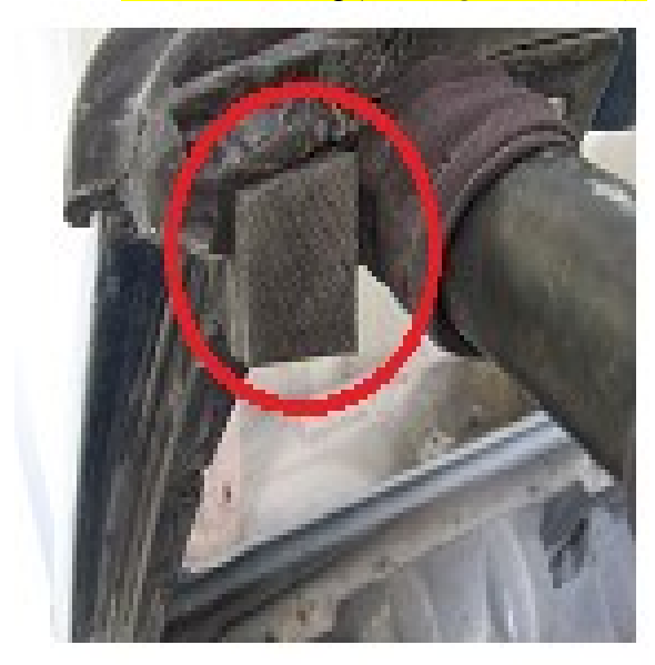
Figure 5 "Top to A-Pillar Gasket"

Important: Check for bent A-Pillar Moldings. Due to the age of the LJ's many of the A-Pillar molding's we see are bent. Bent Pillar Molding's must be replaced to achieve a water tight seal with the hardtop( See Figure 6 below).