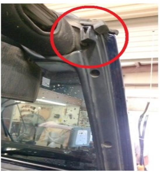
Figure 6 "Bent A-Pillar"