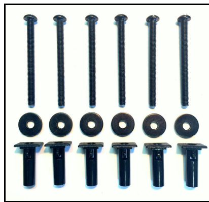
Figure 1 - Standard Installation Kit(YJ)